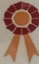
Chairman (YP) IET Chennai Network